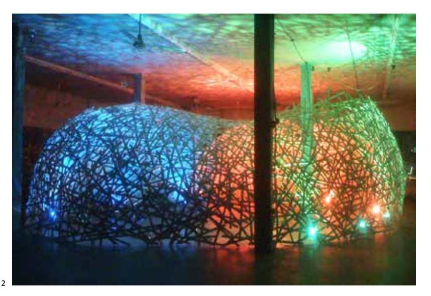
Figure 2: Art of Space, Woven Lignin/Pick-Up Stick Pavilion (Gerard Nadeau).